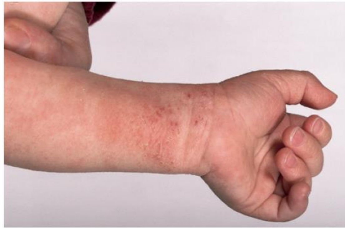
Plate 2 Atopic eczema.